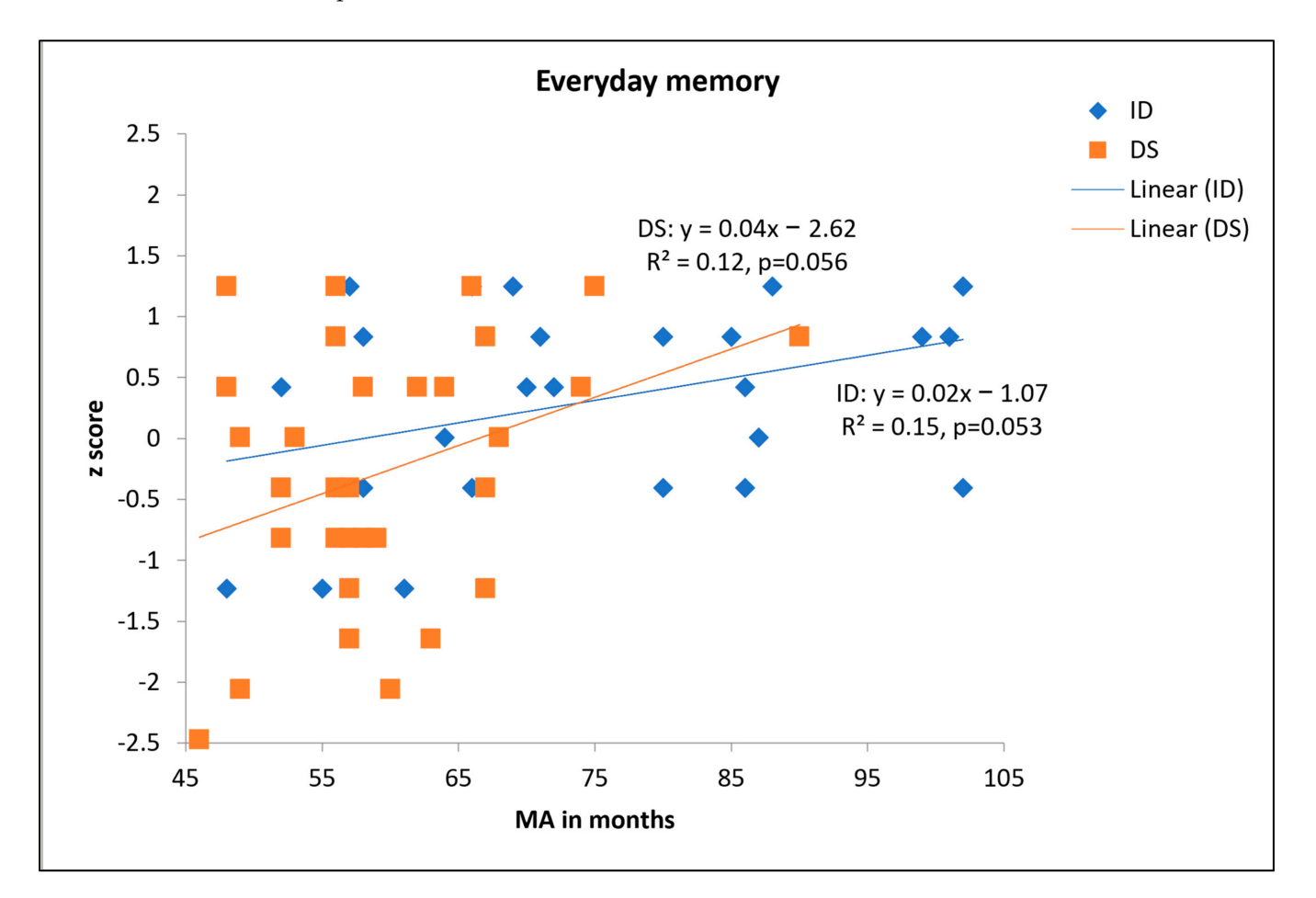
Figure 1. Scatterplot of z scores in everyday memory as a function of MA.

We converted raw scores to z scores using the overall mean and standard deviation of the full sample. We then regressed everyday memory on MA for the DS and mixed ID participants separately. These are shown in Figure 1. MA accounted for 15% of variance in everyday LTM (p = 0.053) for persons with mixed ID and 12% of variance (p = 0.056) for person with DS.